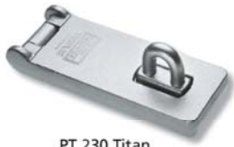
PT 230 Titan