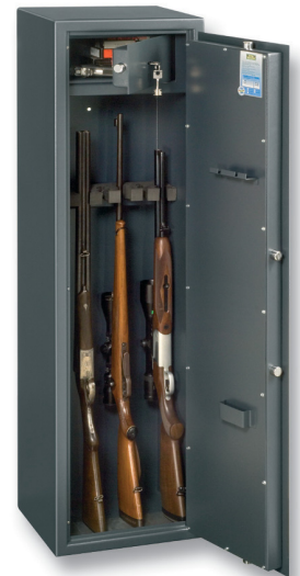
Ranger W 7