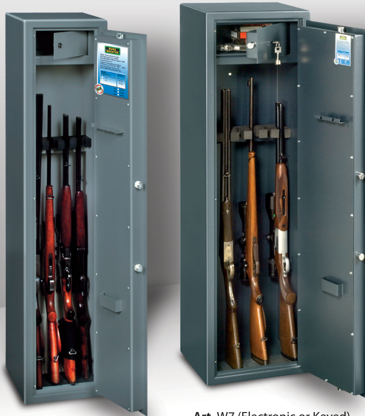
Art. A5 (Electronic or Keyed)