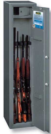
Ranger A 5