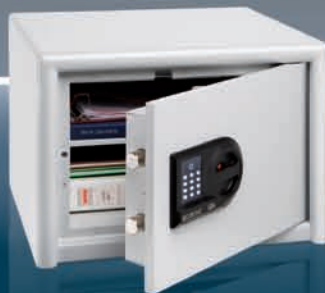
CL 20 E