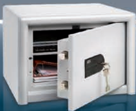
CL 10 S