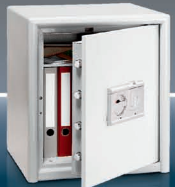
CL 40 E FS