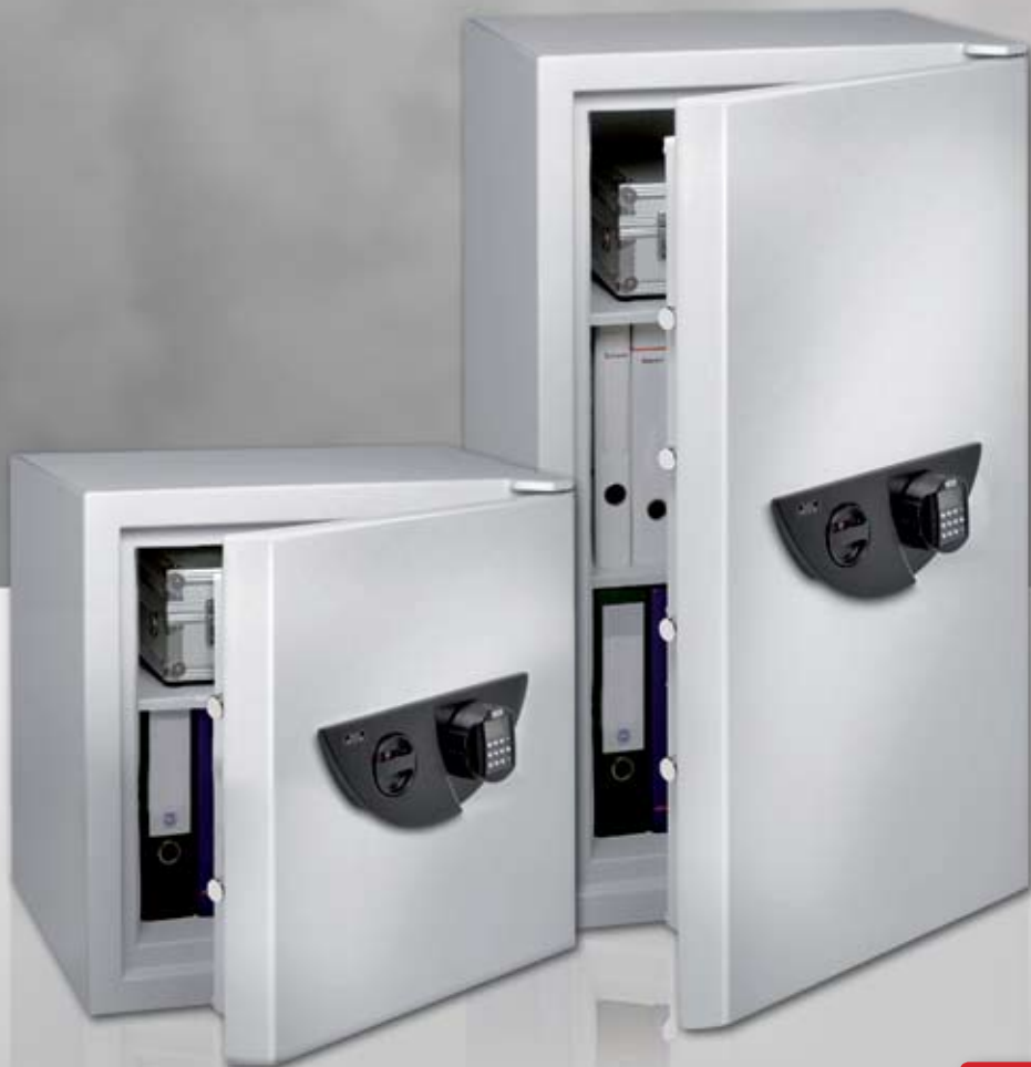
OfficeDoku 121 E & 124 E

OfficeDoku Safes are type tested and supervised security by ECB.S.v. With three-sided locking through 28mm Ø bolts, 1 hour fire protection for paper documents, intelligent menu-driven operation, up to 10 users and the option for biometric security, OfficeDoku Safes cater to all your commercial security needs.